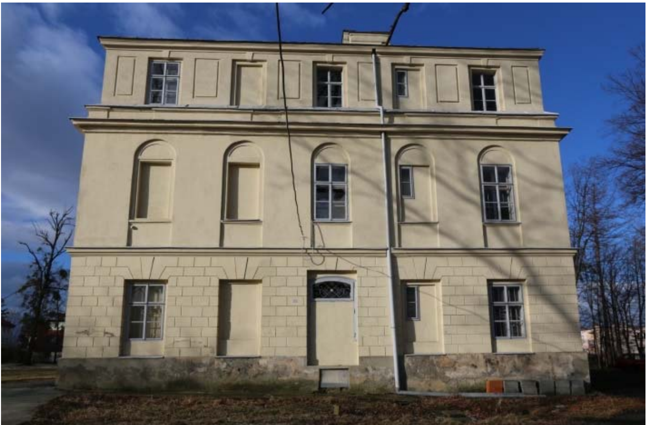
Fig. 15: Castle Hnojník, the east façade, photo, 2020.