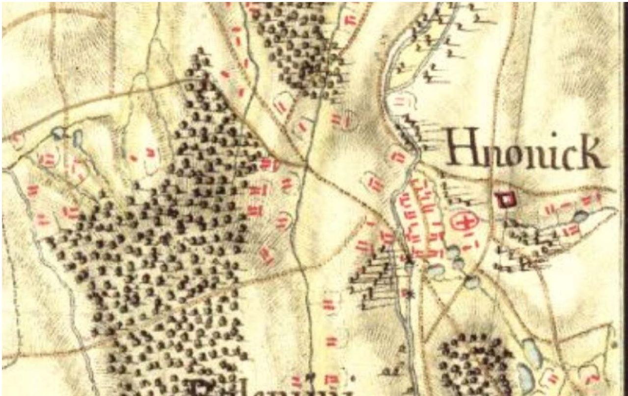
Fig. 2: Hnojník, 1st military survey, Section 13, 1764–1768. www.oldmaps.geolab.cz