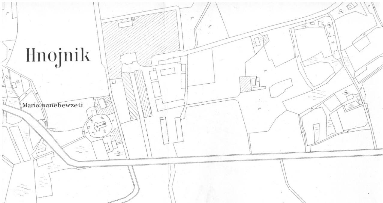
Fig. 4: Hnojník, cadaster map, 1907.