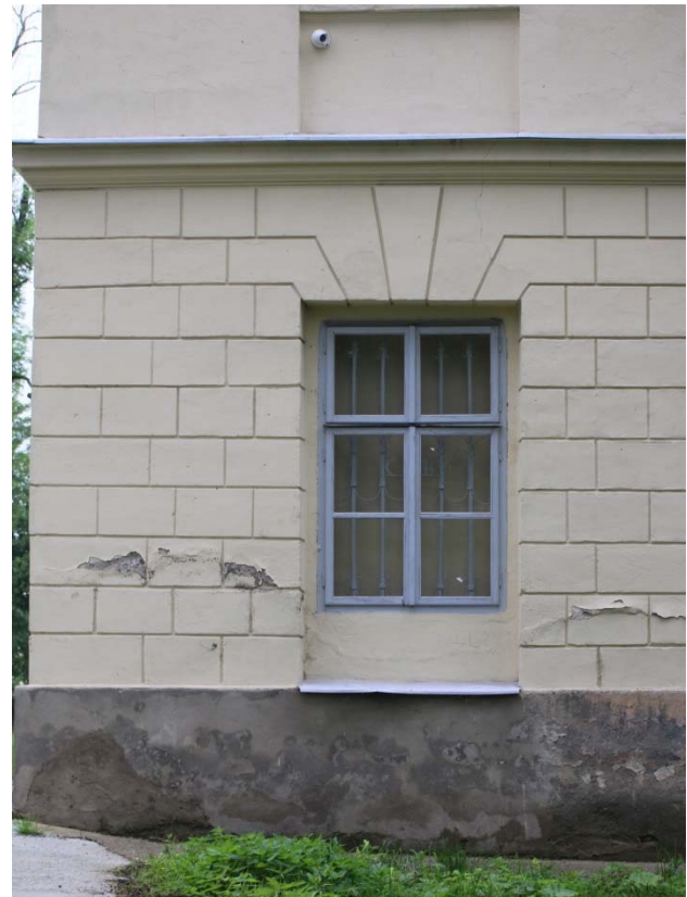
Fig. 16: Castle Hnojník, the east façade with a blind window, photo, 2020.

The castle and its neighbourhood deteriorated for over than 20 years. The works of arts in the garden have been stolen. The hornbeams planted in front of the south façade have grown and block an important part of the cultural landscape – the view of the hill Godula from the castle. The contemporary owner PRIGO Group started renovation of the castle in 2020.