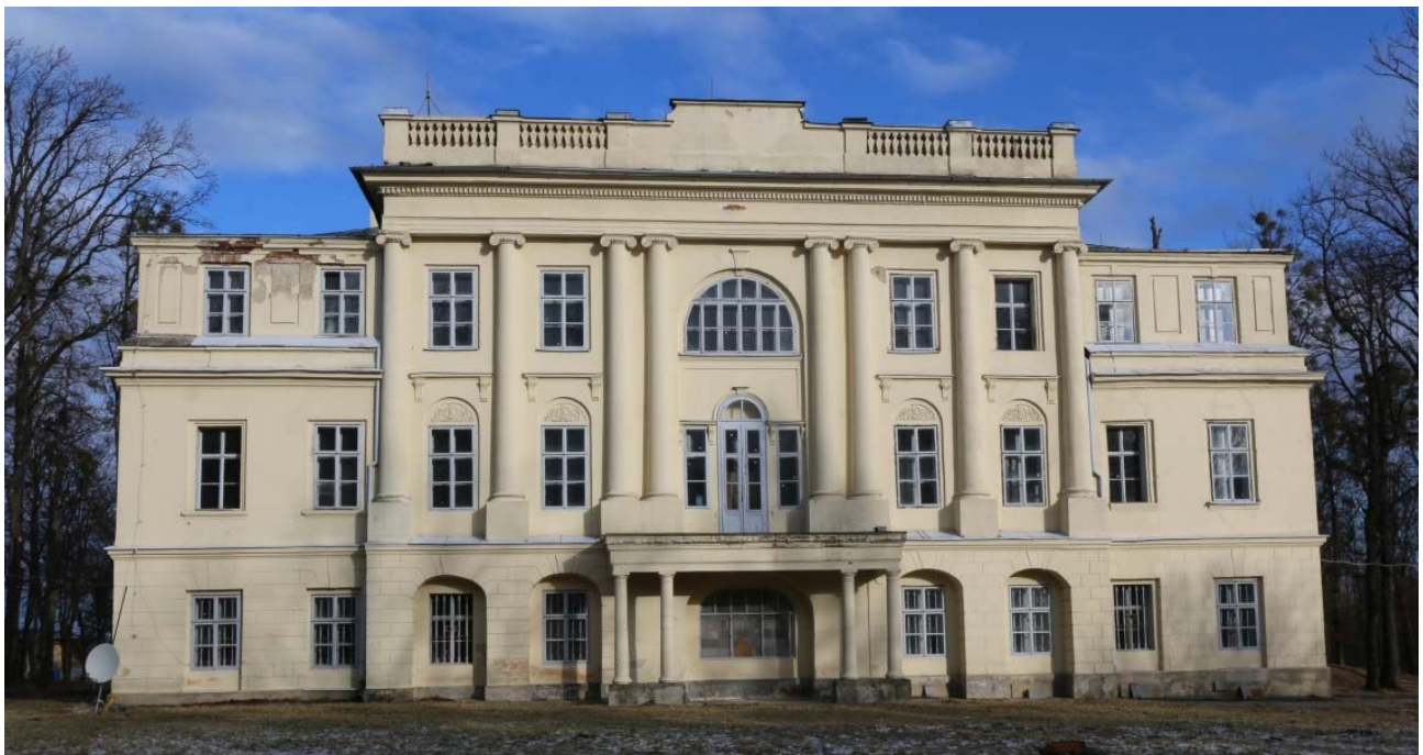
Fig. 1: Castle Hnojník, the south façade, photo, 2020.

Castle, municipality of Hnojník, renaissance, baroque, classicism, man-made landscape.