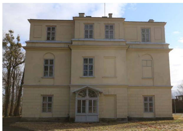
Fig. 13: Castle Hnojník, the west façade, photo, 2020.

The neighbourhood of the castle was also landscaped into a garden, maybe (from the later sources) French formal garden, in the time of Karl Wenzel von Bees. From the south side there is a view of the hill Godula, accented presumably with the alley of low bushes in this time. The landscape adaptation into parks was very often in the Baroque period. These large landscape adaptations were in the neighbourhood of big castles, such as the Schliessheim in Bayern [6] or Gottdorf in Schleswig [7]. The garden in Kravaře, landscaped into a French formal garden, is drawn on a minutely described map from 1788. The landscape adaptations were frequent in neighbourhoods of small castles in villages as well. Alleys along access roads were commonplace, e.g. in Rychvald. In the garden in Kravaře there were a few alleys, too.