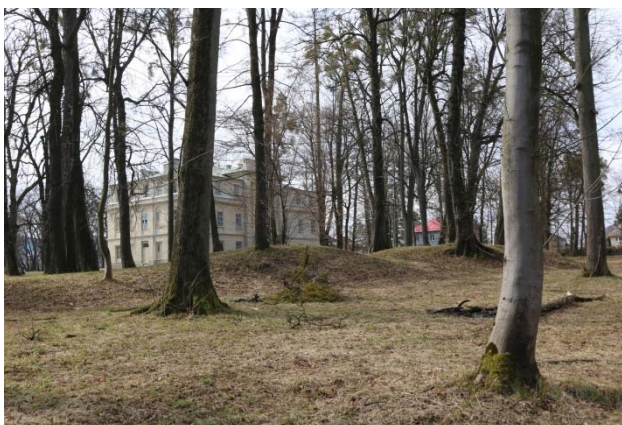
Fig. 10: Hnojník, the neighbourhood with the under terrain rest, southern hornbeam avenue, photo, 2020

Eastwards there is a large farm (former demesne farm) with new and original old buildings. The location of the demesne farm was drawn on the map of stable cadastre as early as in 1836.