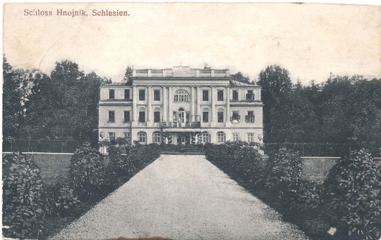
Fig. 9: Hnojník, south façade, postcard, 1928.