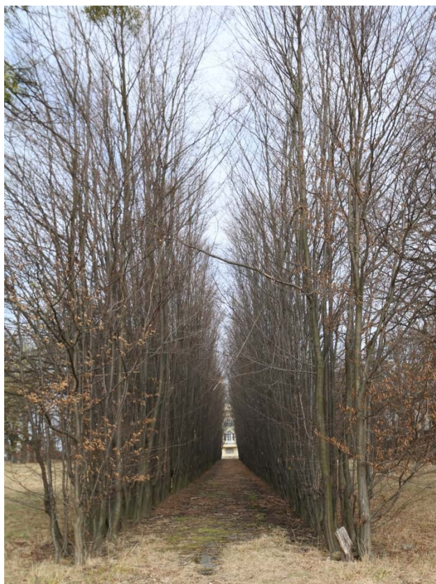
Fig. 11: Hnojník, the neighbourhood of the castle, southern hornbeam avenue, photo, 2020

The latest investigations [4] suggest the fortified house had been rebuilt into the castle by Karl Free Lord von Bees between 1736–1751. Some of the iron bars in the windows bear the initials CFB. It means German Carl Freiherr von Bees , this is Carl Free Lord von Bees. After rebuilding the castle got today's ground plan and a rhythm of façades. The mass composition of those days can be seen on the postcard from 1899: the central part of the castle with 3 floors and an attic, The lateral parts with 2 floors had mansard roofs covered with shingles.