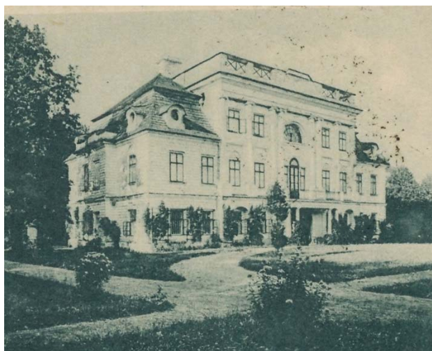
Fig. 5: Hnojník, the detail of the postcard, 1899, Ostrava Museum.

The date when the castle was reconstructed is known exactly neither. Even though earlier years can be found in literature, the most important source of information is a postcard with a picture of the south façade dating back to 1899 [22], in which the castle still with attic roofs can be seen.