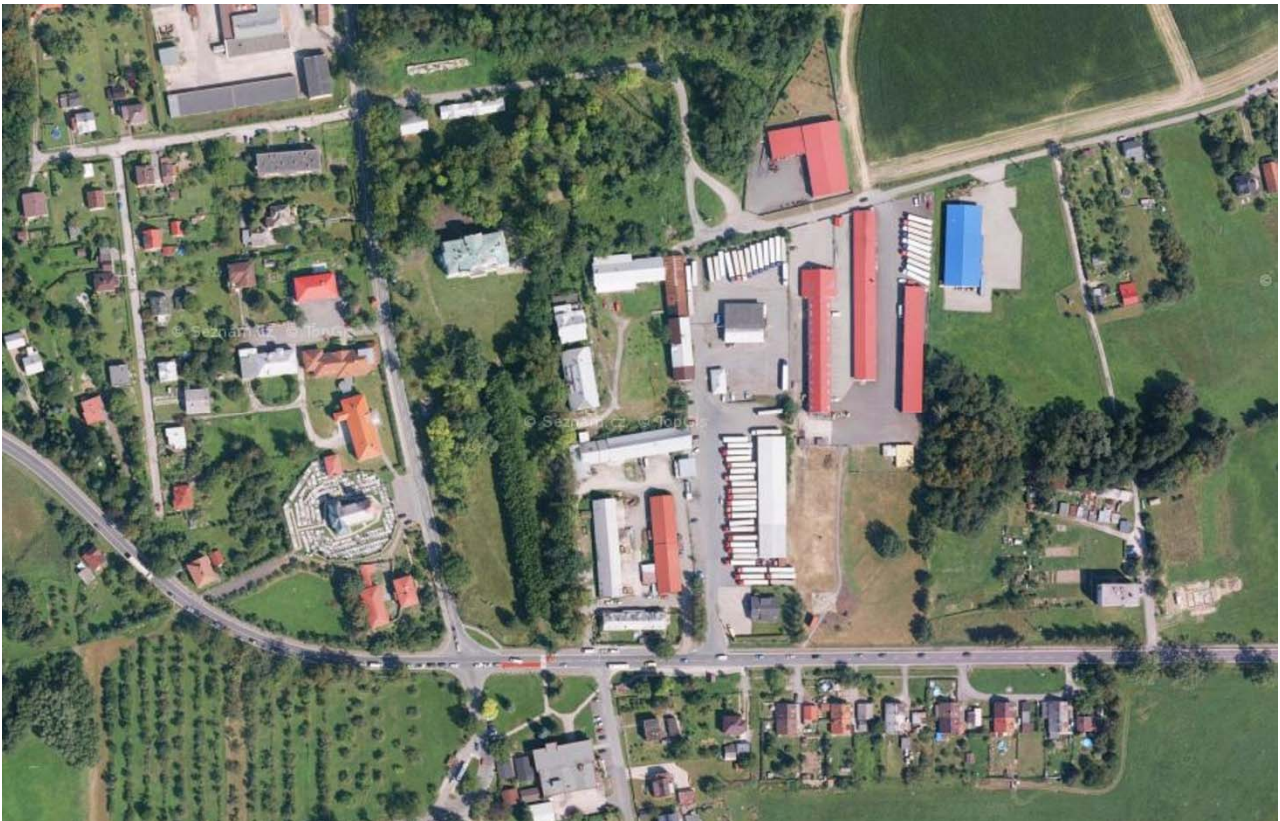
Fig. 14: Hnojník, aerial photo, 2020.