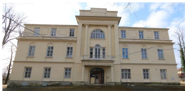
Fig. 12: Castle Hnojník, the north façade, photo, 2020.

The 1st military survey from 1764–68 in view of a drawing of Hnojník brought a research problem. The castle is painted as a four-wing object [27]. This first military survey of the Austrian Monarchy was made only in the form of an observation not measurement, so called à la vue . In those maps there are a lot of mistakes. Drawing wrong number of wings especially in noble residences was very commonplace. E.g. a fortified house in Velká Polom had surely four wings in the 18th century. Unlike that, it is painted as 2 isolated objects on the 16th Silesian map from the 1st military survey [27]. The castle in Klimkovice is drawn as a two-wings building only on the 17th Silesian map [27], nevertheless we are completely sure, that the castle had four wings as early as in the 1760s.