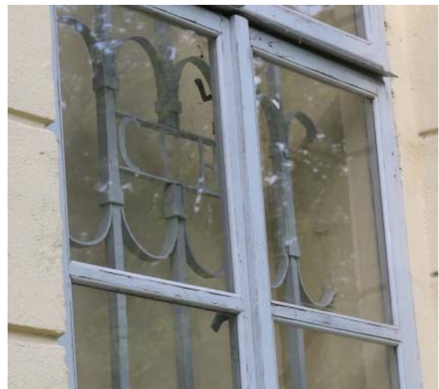
Fig. 17: Castle Hnojník, the east façade, the blind window with the initials of CFB, photo, 2020.

The castle and former fortified house has been important part of the cultural landscape since the early New Age. It has had decisive influence on the form of manmade landscape – municipality of Hnojník, especially since the garden was established.